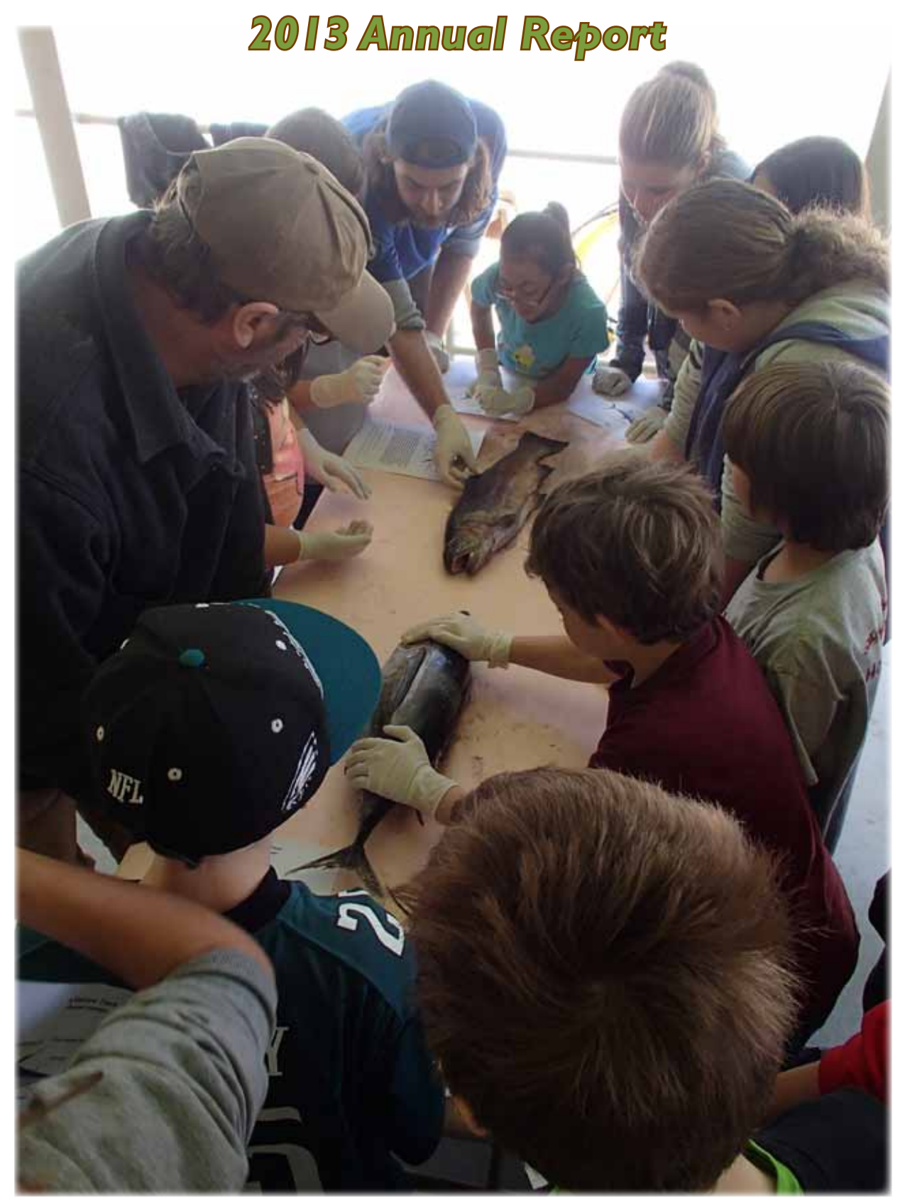
School kids enthralled with fish dissecting during a Watershed Education class.